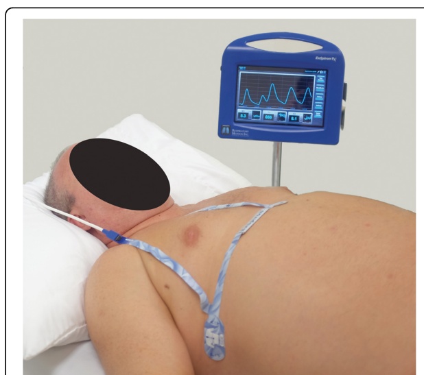
Figure 1 A non-invasive respiratory volume monitor (ExSpirom; Respiratory Motion, Inc.) that provides continuous, real-time, non-invasive measurements of minute ventilation, tidal volume and respiratory rate. This photograph shows standard electrode placement on an obese patient (not the patient reported here; body mass index, 36.7kg/m 2 ). One electrode is placed at the sternal notch, another on the xiphoid and the third in the right mid-axillary line at the level of the xiphoid.

The patient's past medical history was positive for OSA, with no other respiratory conditions. The patient owned a home model of a continuous positive airway pressure (CPAP) device but had not been using it. In the pre-operative holding area, the patient was very sleepy, though not yet sedated. The RVM trace showed sustained, visible manifestations of apnea over this period (Figure 2B).